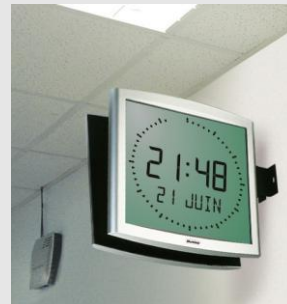
Cristalys Ellipse on double sided bracket