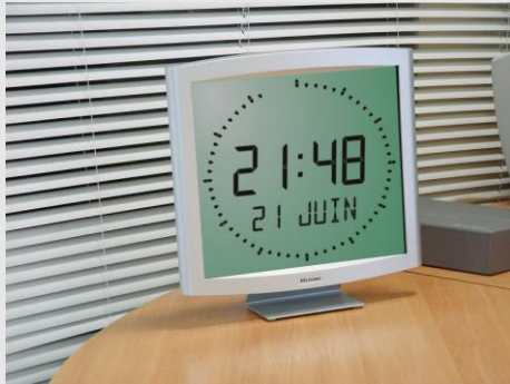
Cristalys Ellipse on table support