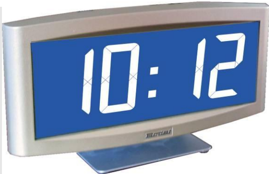
Opalys 7 on table support