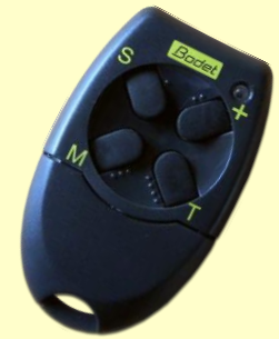
Wireless remote control